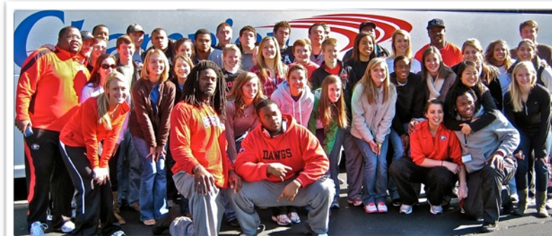
WEEKLY STUDENT LEADERSHIP MEETING